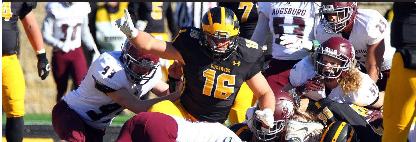
WEEK 7 • SAINT PETER, MINN. • GUSTAVUS 42, AUGSBURG 0

Another strong defensive performance paired with a scoring outburst in the first half propelled the Gustavus football team to a 42-0 shutout victory over Augsburg on Saturday afternoon at Hollingsworth Field. The convincing win marks the 500th all-time victory for the Gustavus football program, which is in its 102nd season. Gustavus is now one of 57 NCAA Division III institutions with at least 500 wins with an all-time record of 500-359-21.