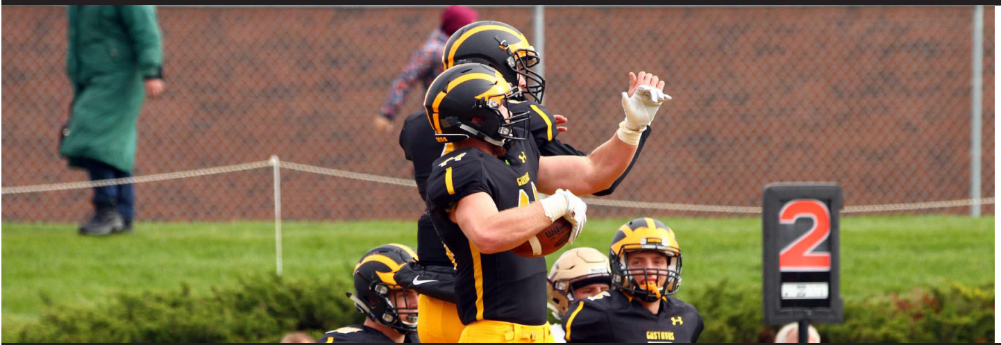
WEEK 6 • SAINT PAUL, MINN. • GUSTAVUS 42, HAMLINE 14

Two blocked punts, one recovered for a touchdown, and a punt return touchdown highlighted the Gustavus football team's 42-14 win at Hamline on Saturday afternoon. The Gusties also had three rushing touchdowns and surpassed 400 yards of total offense for the first time this season to move to .500 at 3-3 overall and 2-2 in the MIAC.