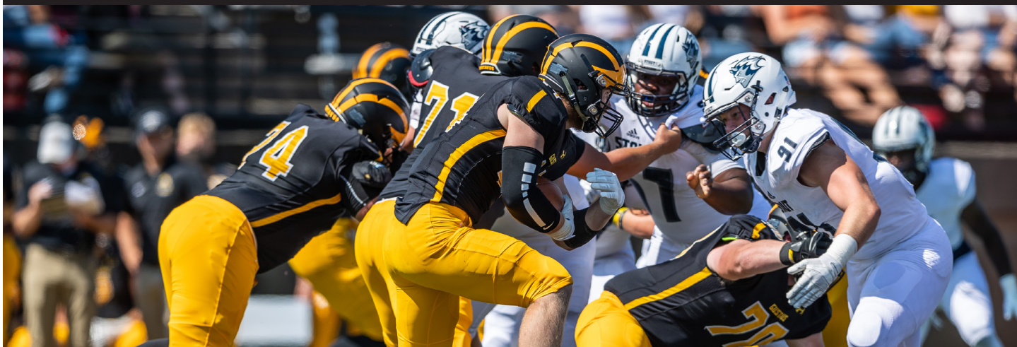
WEEK 2 • SAINT PETER, MINN. • GUSTAVUS 23, UW-STOUT 24 (OT)

Despite holding a 17-0 lead though 43 minutes of play Saturday, the Gustavus football team suffered a deflating 24-23 overtime loss to UW-Stout in the home opener. The Blue Devils scored the game-tying touchdown with eight seconds remaining in regulation, scored a touchdown on their first overtime possession, and blocked the would-be game-tying extra point to complete the improbable comeback.