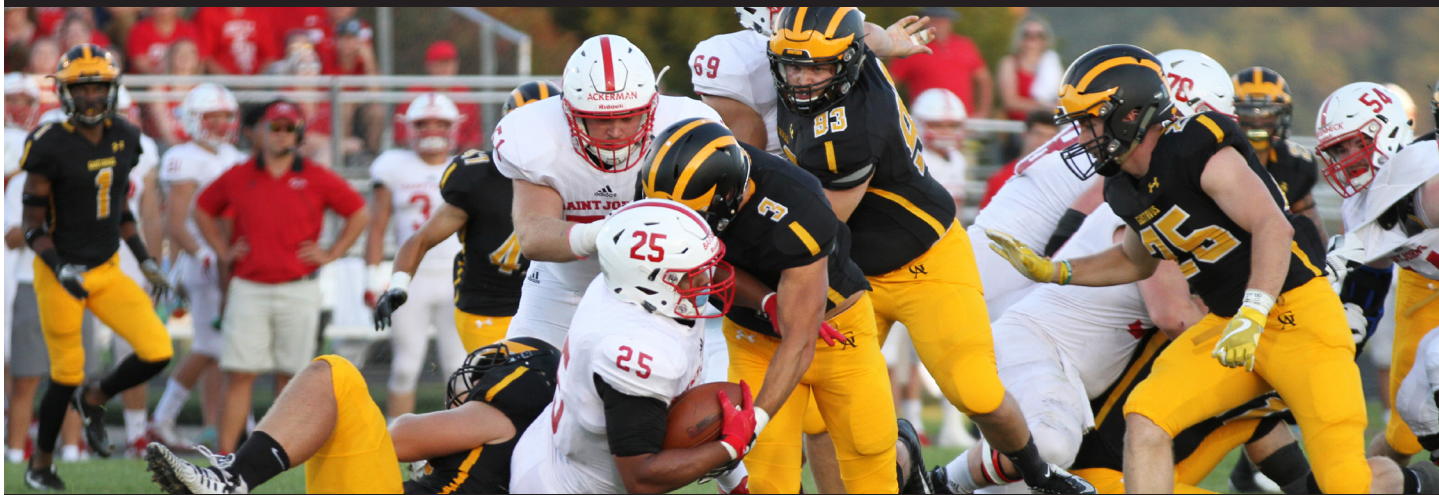
WEEK 3 • SAINT PETER, MINN. • GUSTAVUS 13, SAINT JOHN'S 45

In the first home night game since 1988, the Gustavus football team dropped a 45-13 decision to No. 9 Saint John's on Saturday night at Saint Peter High School's Floyd B. Johnson Memorial Field. The Gusties drop to 1-2 overall and 0-1 in the MIAC, while the Johnnies move to 2-0 overall and 1-0 in the league. The game was moved back to 7 p.m. from 1 p.m. due to afternoon heat and humidity levels that would have warranted significant delays.