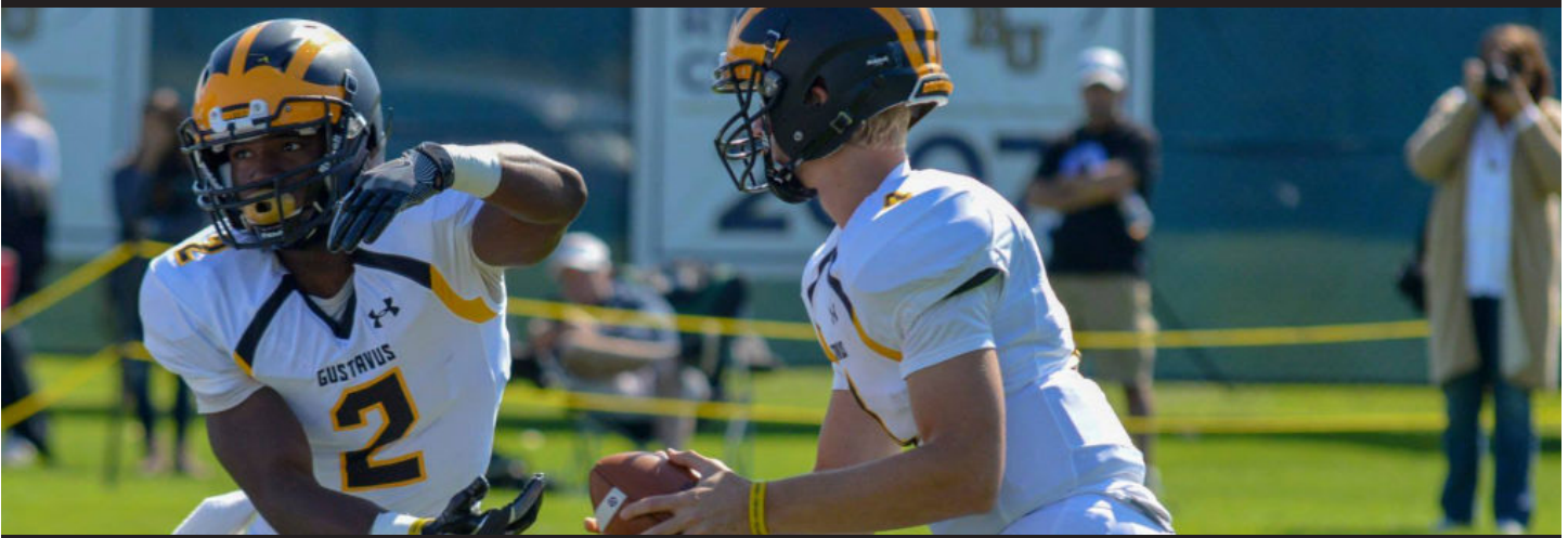
WEEK 4 • ARDEN HILLS, MINN. • GUSTAVUS O, BETHEL 31

The Gustavus football team suffered a 31-0 loss at Bethel on Saturday afternoon. The Gusties fall to 1-3 overall and 0-2 in the MIAC, while the Royals improve to 3-0 overall and 1-0 in the league.